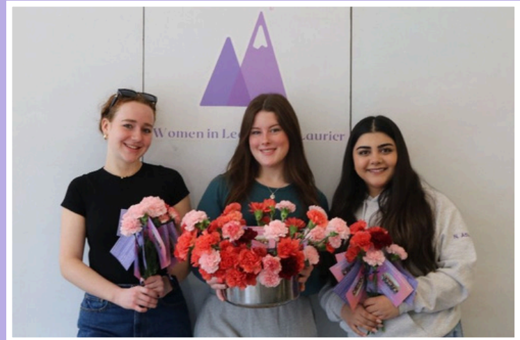
Awarded Club of the Year (for 3 consecutive years)