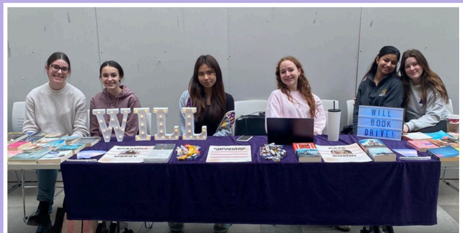
WILL's Little Library (Proceeds donated to the Women's Crisis Services of Waterloo Region)