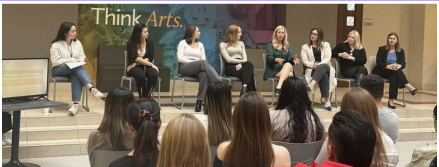
SPEAKER PANEL, 2023