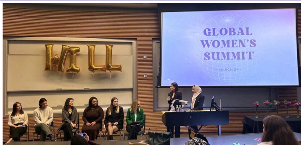
Global Women's Summit, Flagship Event (Spotlighting exceptional women driving change within their firms)